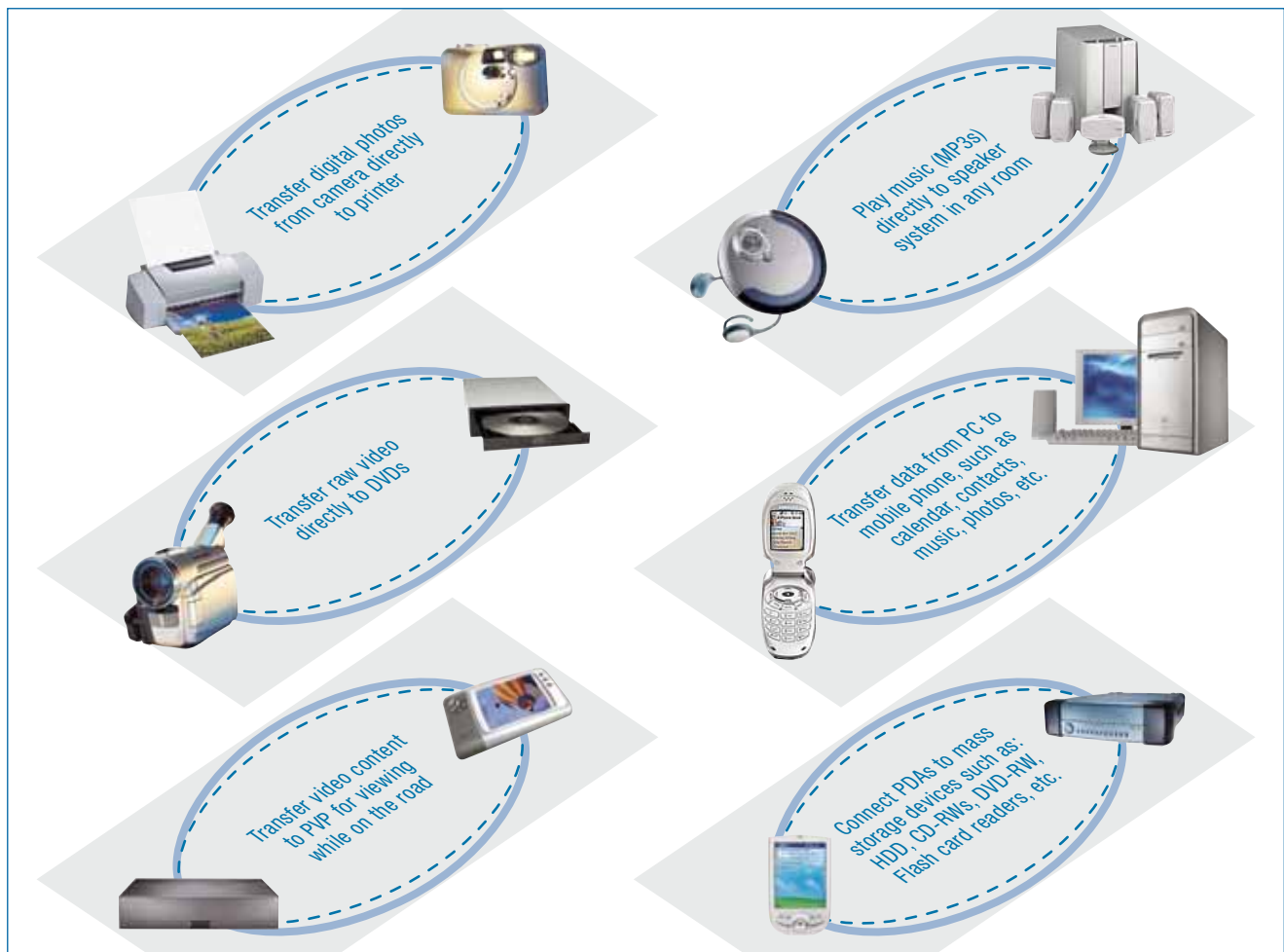
Figure 3. Dual-role devices usage scenarios.

Wireless USB could enable people to wirelessly download and print digital photos to a color printer. Imagine taking