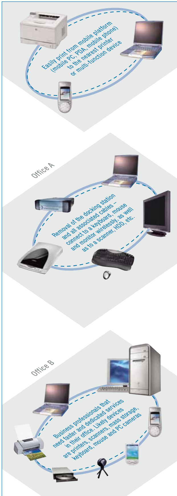
Figure 2. Office usage scenarios for Wireless USB.

like Wireless USB with its projected effective bandwidth of 480 Mbps, could manage multiple HDTV streams while still having the capacity to support other high-bandwidth data streams. Host buffering could enable a network backbone to effectively distribute content to all distribution hosts, enhancing the quality experience for all users. The Wireless USB specification will be an effective way to ensure that the delivered convenience and quality of service meets typical consumer entertainment expectations.